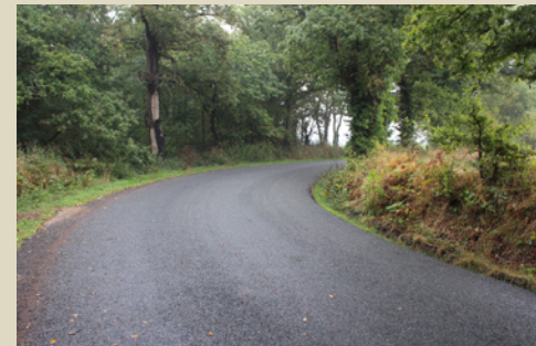
F Junction with Crows Lane and Edwins Hall

Footpath 19 used today is the same path that was used by the staff at the hall the shortest route to the village and church.