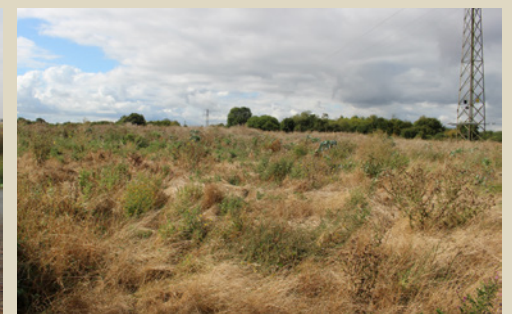
I View towards the stile