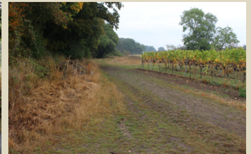
G View north along the bridleway