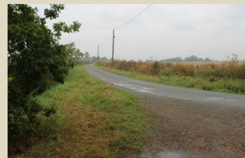
H Left turn to Charity Farm