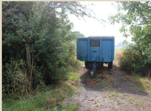
G View of start of path