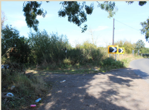
F Hackmans Lane to St. Peters Way