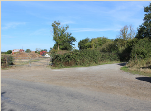
D Crows Lane sharp left walk goes right

The road used by the packhorses carrying the salt from the saltcotes of South Woodham and Stowe Maries.