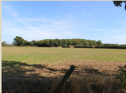
E Way post at start of PR of W across the field