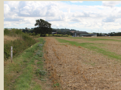
C View towards the farm buildings