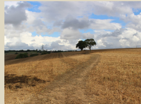
A View along PR of W

Created in 1987, divided from the old parish and town of Woodham Ferrers at the building of the New Town.