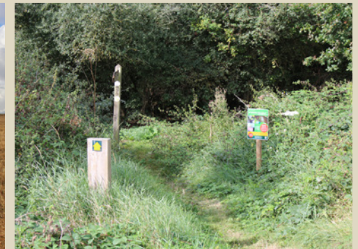
B Gap in the hedge