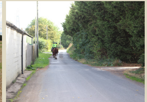
D View along Workhouse Lane