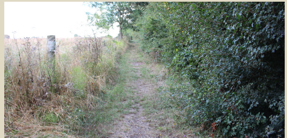
G Right turn up the hill