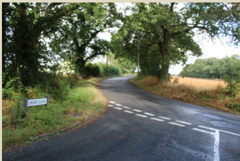
E At the T junction turn left into Crows Lane