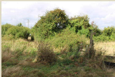
F Proceed diagonally towards the stile